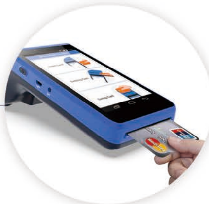
IC card payment