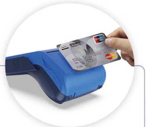
Contactless card payment