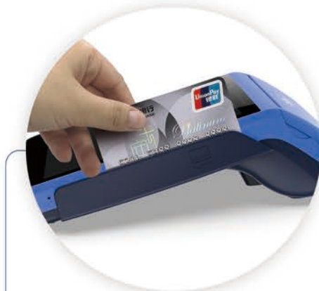
Magnetic card payment